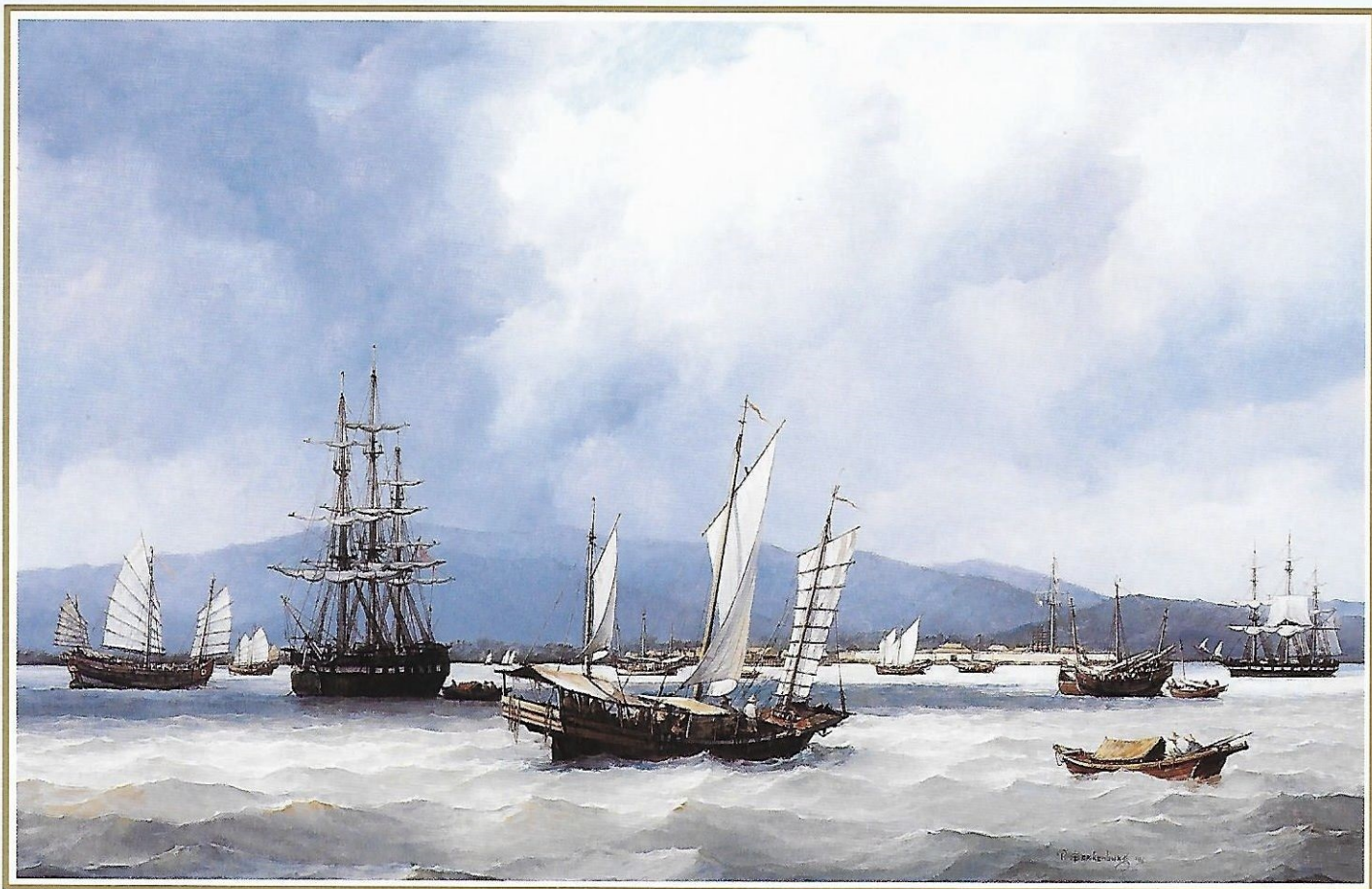
Penang, Georgetown 1850 with the old fort in the background (Size incl. frame ± 95 x 75 cms)

tradition of Dutch maritime painting. Sterkenburg has the extraordinary ability to paint skies and water that appear almost real.