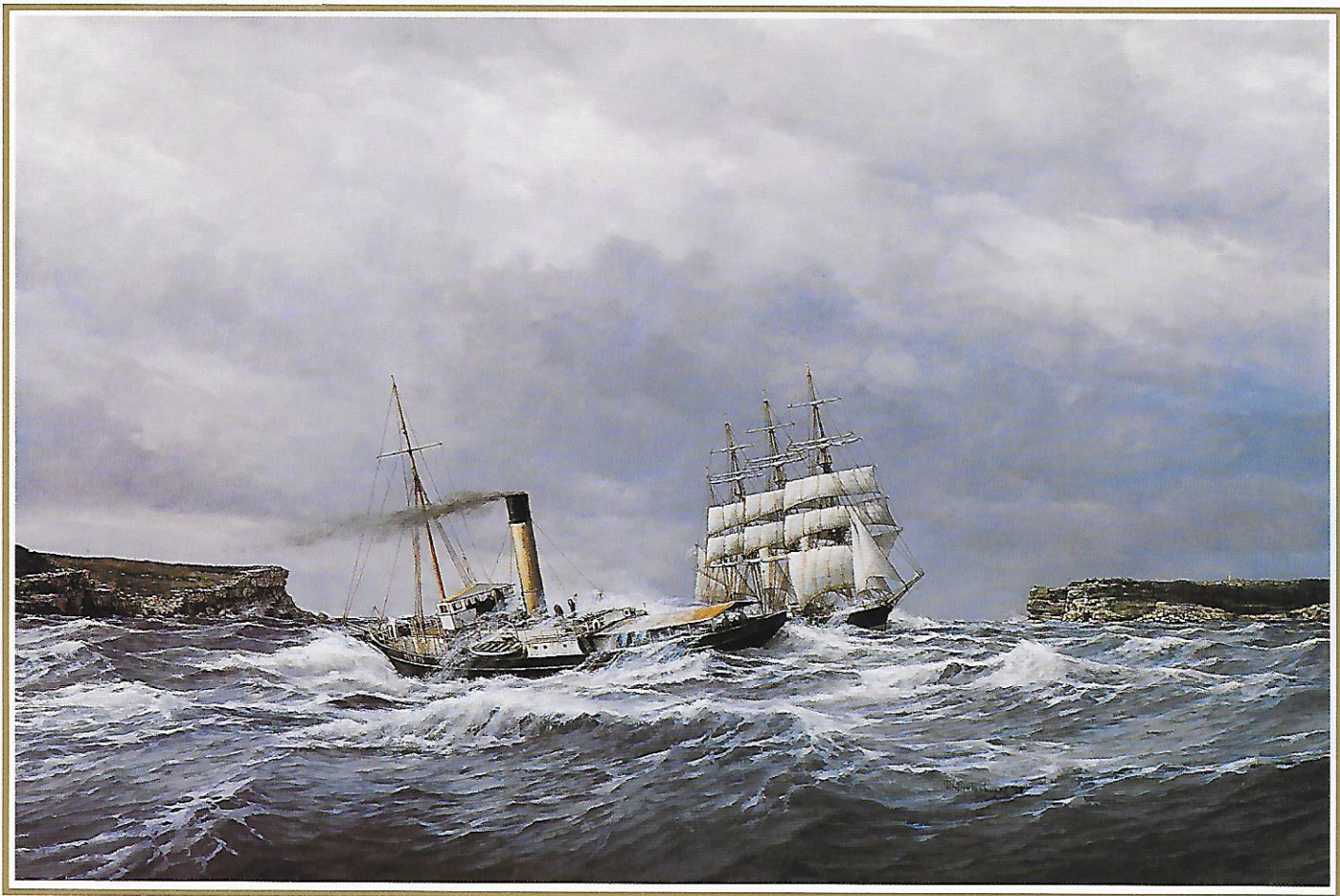
Pilot boat "Captain Cook II", North and South Head, Sydney 1925 (Size incl. frame ± 125 x 95 cms)