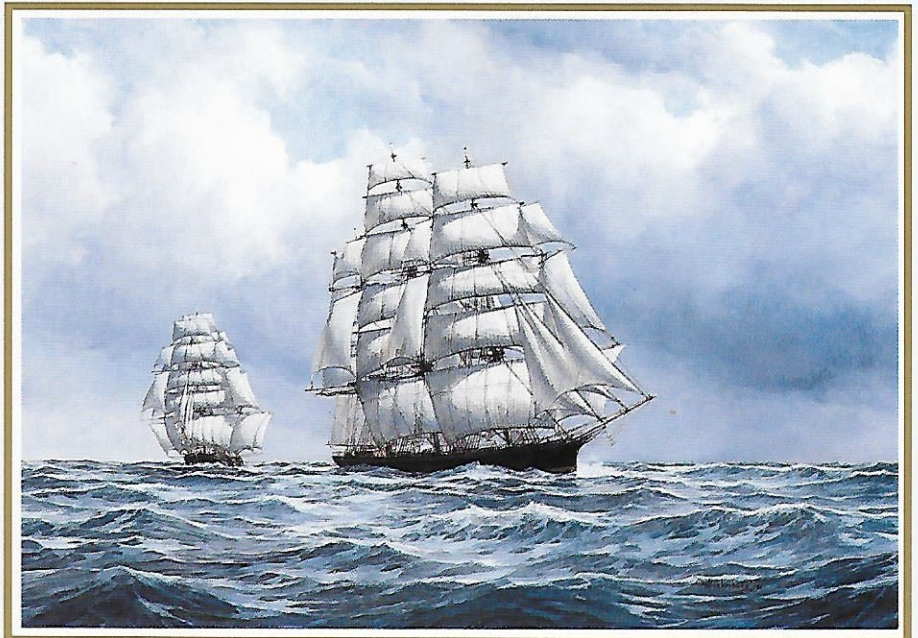
The "Cutty Sark" in a tea race, 1870 (Size incl. frame ± 95 x 75 cms)