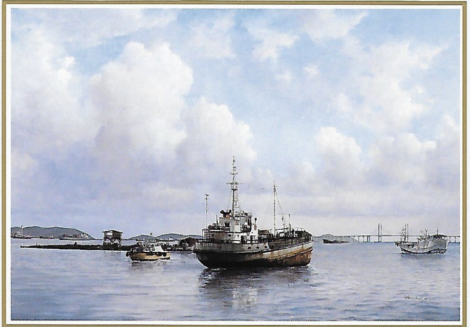
Penang 1995, with Penang Bridge (Size incl. frame ± 115 x 85 cms)