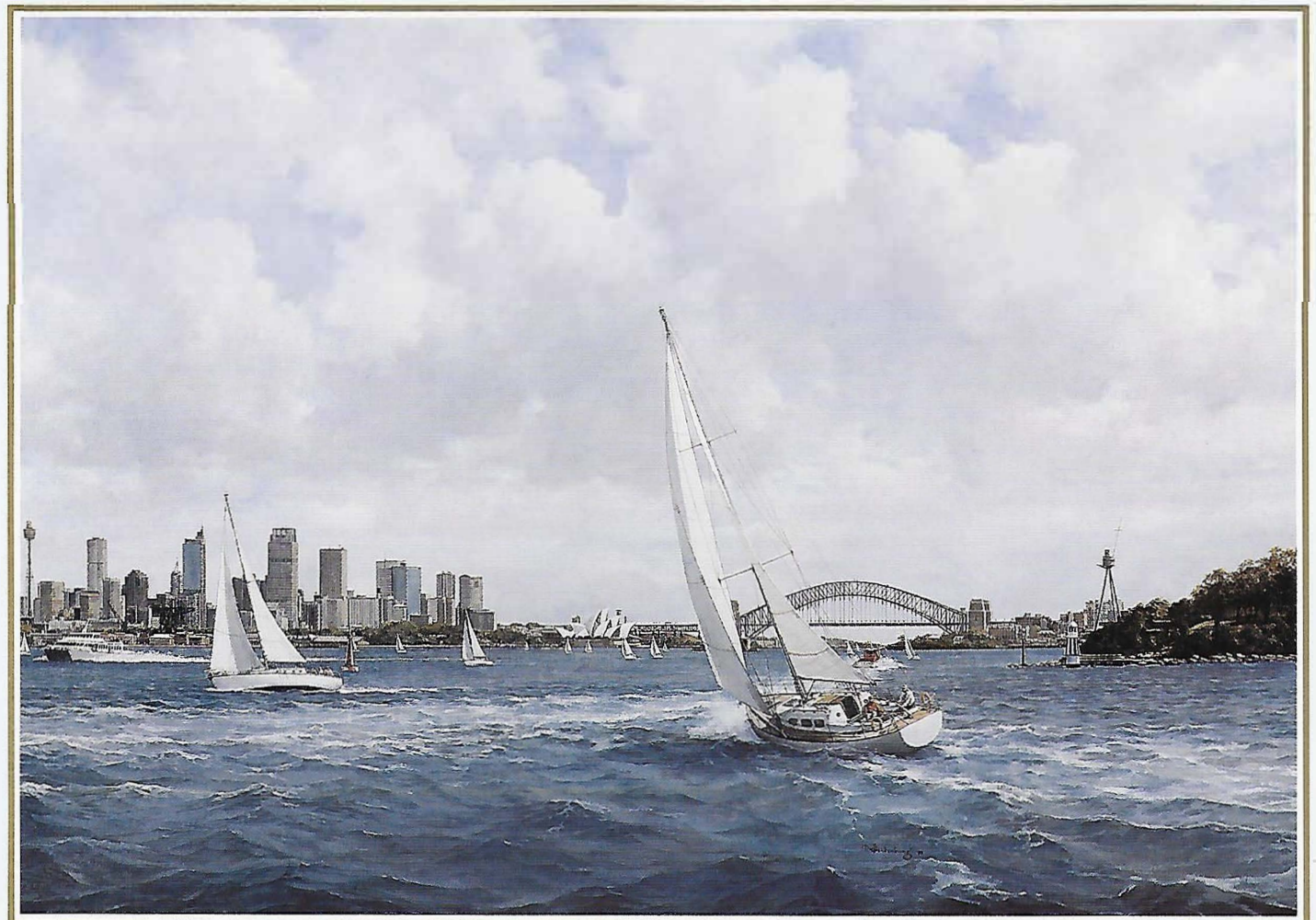
Sydney Harbour 1995 with Bradleys Head on the right (Size incl. frame ± 150 x 115 cms)

The artist’s talent in depicting romantic maritime landscapes gives his paintings a unique colour and style and makes him part of the long