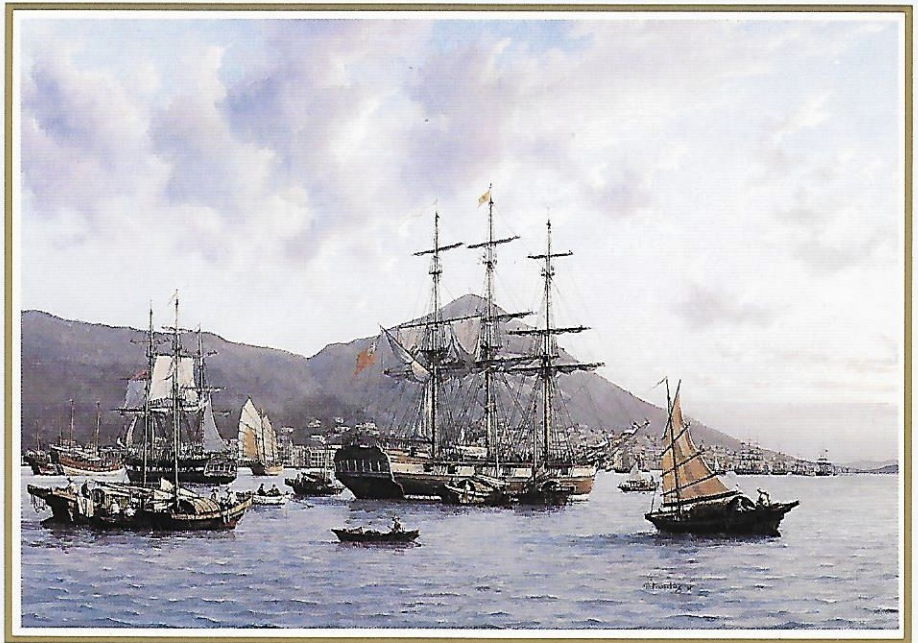
Hong Kong 1860, Victoria Harbour (Size incl. frame ± 115 x 85 cms)

Painting on the cover: Melaka around 1650, Dutch East India vessels and a junk in the foreground ready to anchor and the old town in the background (Size incl. frame ± 155 x 125 cms)